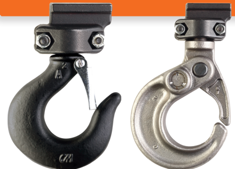
Swivel Hook with Latch

Get the versatility and flexibility you need to rig truss, lighting and audio in confined spaces. Optional swivel hook rotates a full 360° to allow for easy attachment to slings and pick points.