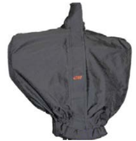
Weather proof raincoat optionally available